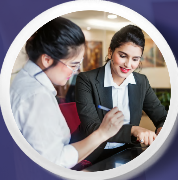
BANKING & INSURANCE