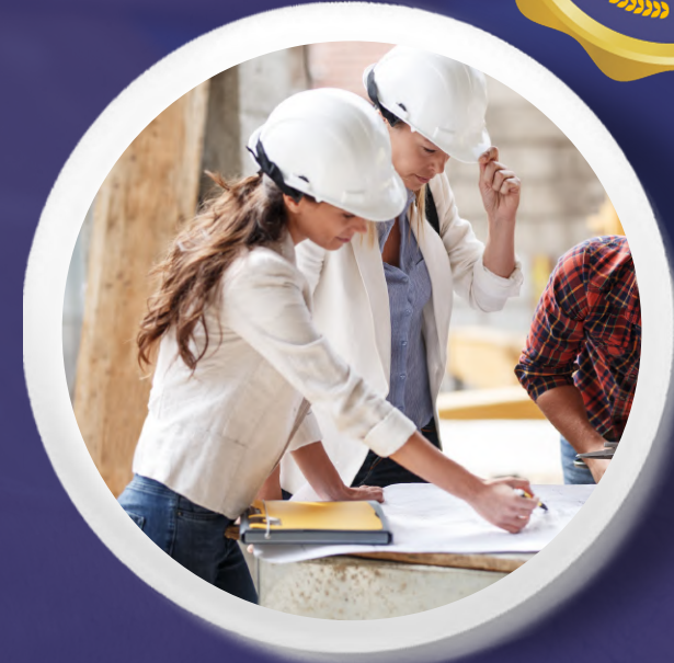
INFRASTRUCTURE & CONSTRUCTION