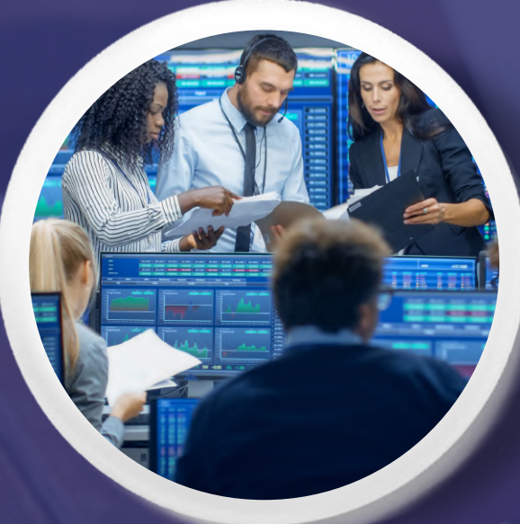
FINANCIAL SERVICES & CONSULTING