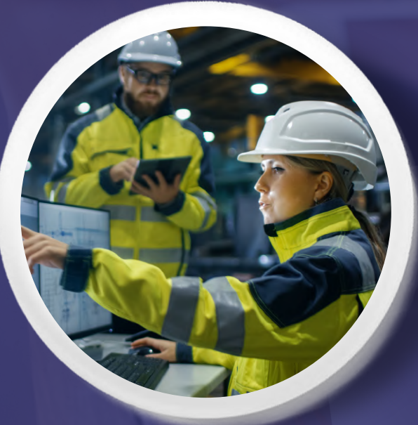
HEAVY INDUSTRIES AND MANUFACTURING