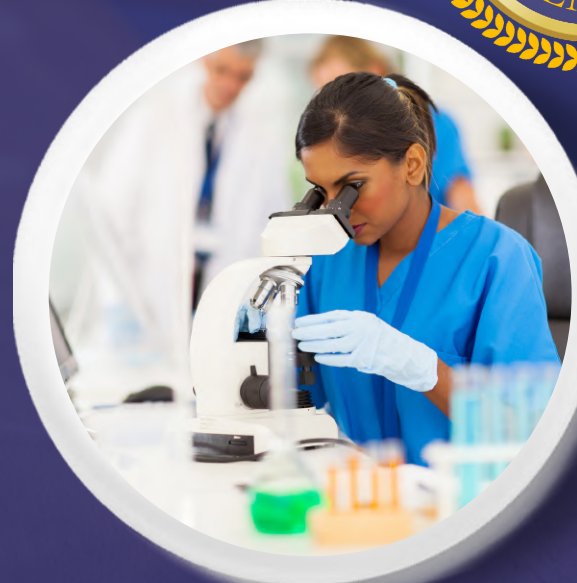
PHARMACEUTICAL & HEALTHCARE