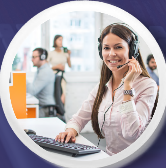
BPO & KPO