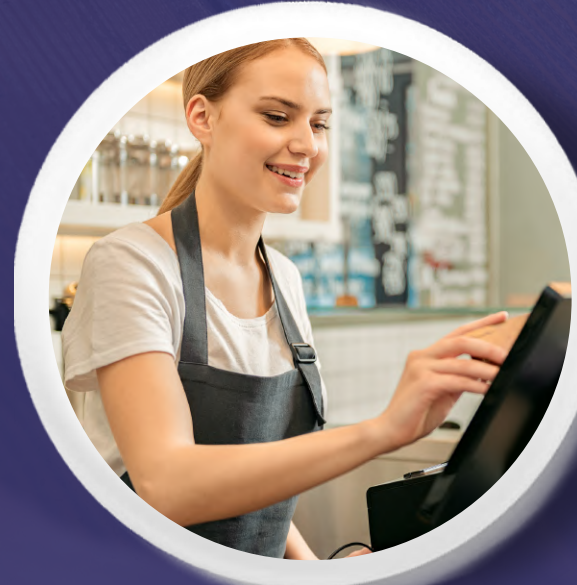
RETAIL & LIFESTYLE